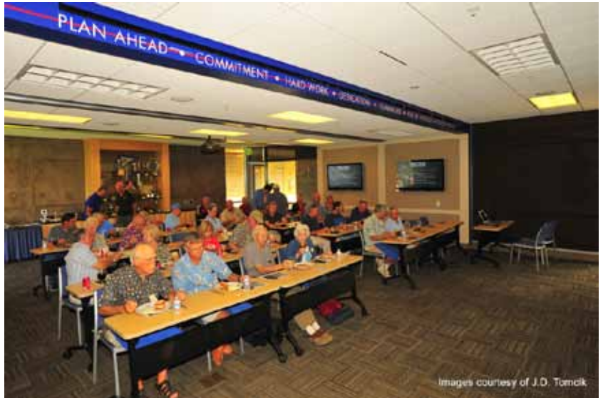
WHAT A CROWD!