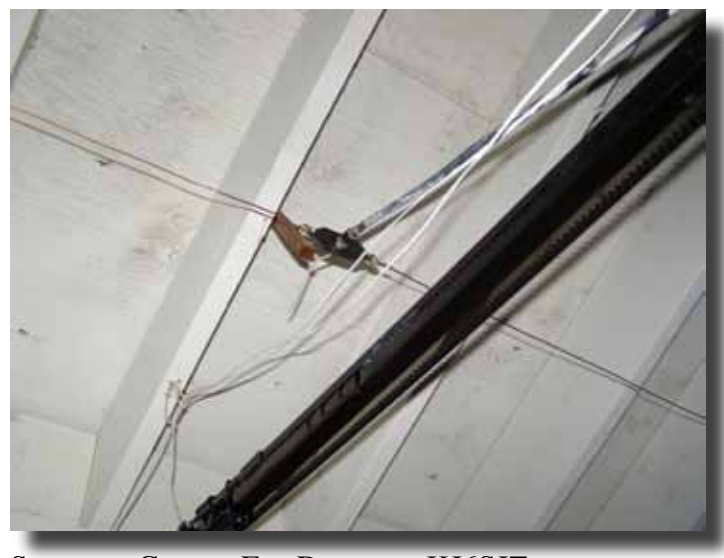
STEALTHY CENTER-FED DIPOLE AT KJ6SJZ