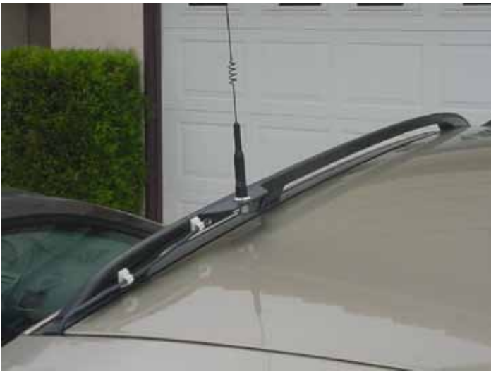
ANTENNA FULL VIEW

The antenna is a Comet B-10 with a 3D5MB cable assembly. It hasn't hit anything yet and is easy to remove for machine washing of the car. I'm still looking for a better way to secure the cable and route it inside.