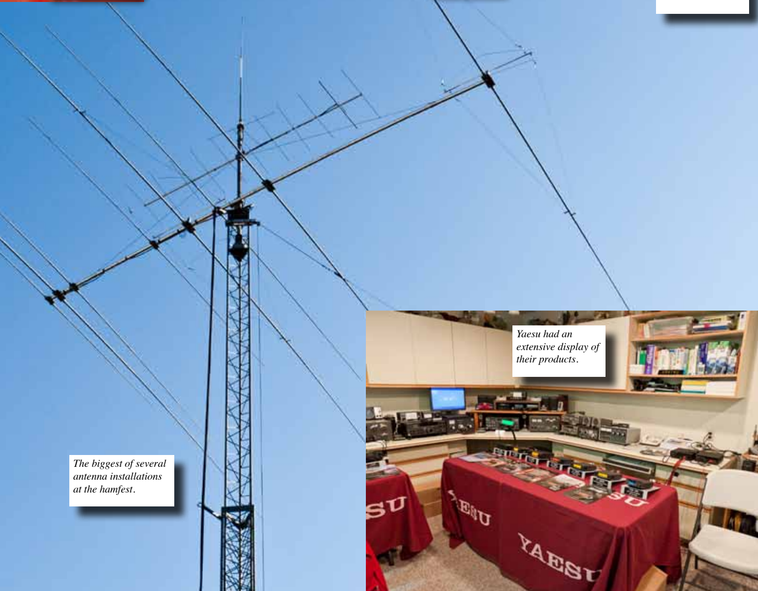
The biggest of several antenna installations at the hamfest.