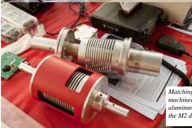
Matching networks machined out of aluminum tubing at the M2 display.