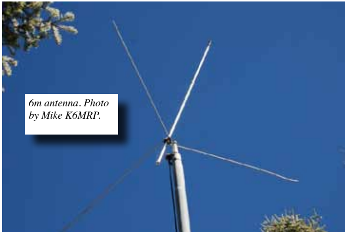
6m antenna.

House batteries and control battery levels look good. Rectifier ( 48 vdc charger ) working OK. General site condition looks good. 2 Feb 2011.