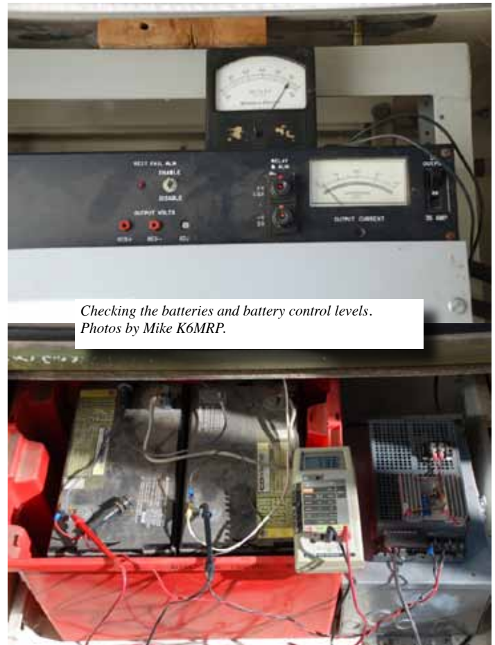
Checking the batteries and battery control levels.