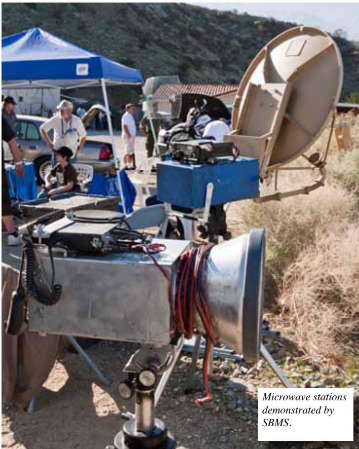
Microwave stations demonstrated by SBMS.