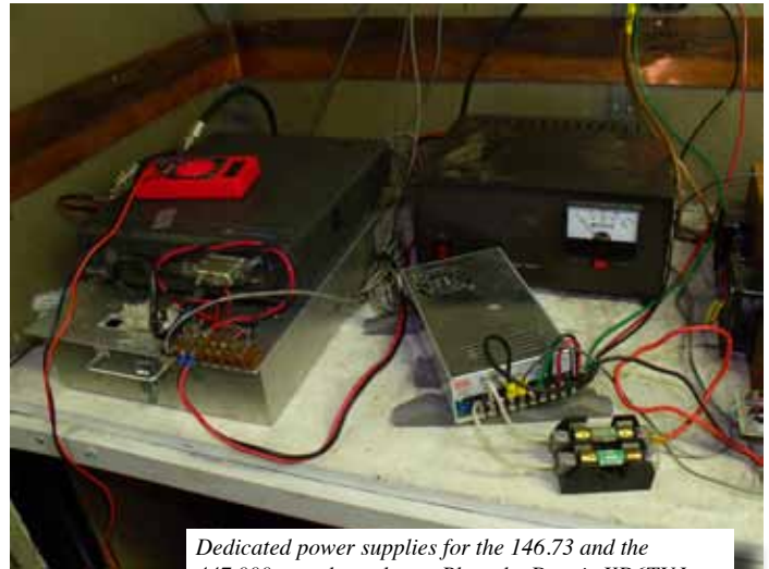
Dedicated power supplies for the 146.73 and the 447.000 were brought up.

http://palomararc.org/zenphoto/work-parties/work-party-at-repeater-site-february-2011/