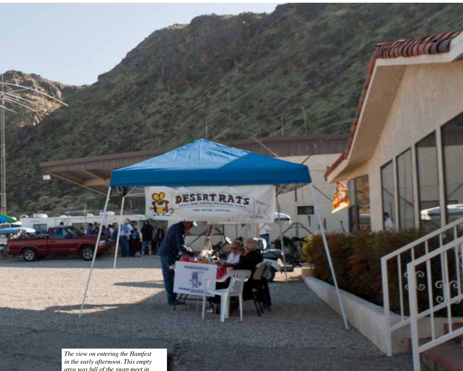
The view on entering the Hamfest in the early afternoon. This empty area was full of the swap meet in the morning. Under the blue shade, friendly folks collected my nominal $1 admission fee.