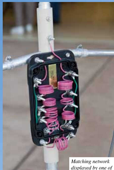
Matching network displayed by one of the vendors.