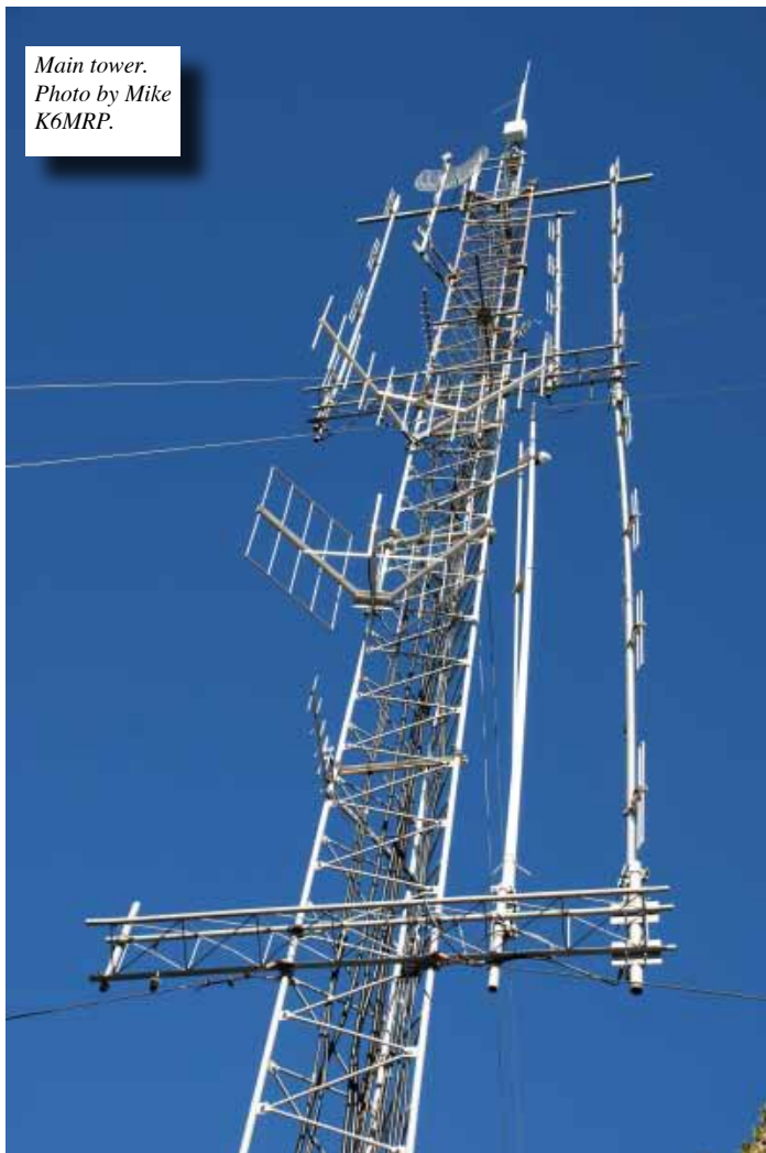
Main tower.