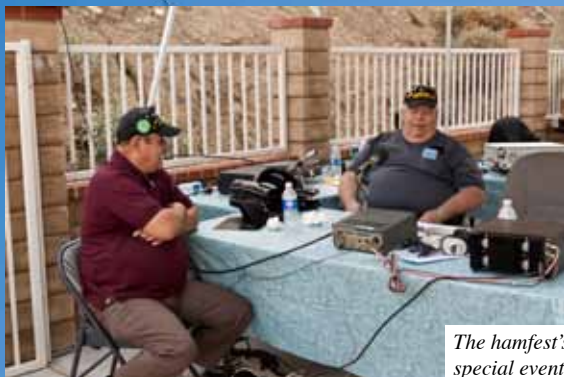
The hamfest's special event station.