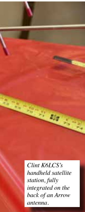
Clint K6LCS's handheld satellite station, fully integrated on the back of an Arrow antenna.