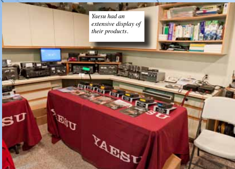
Yaesu had an extensive display of their products.