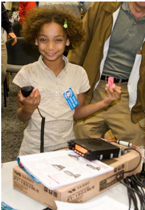
December's raffle winner.

Available for raffle at the January meeting will be a Yeasu VX-170 2m hand held radio. In the spirit of ARES, which is our January program, this radio will also have a AA battery pack and a MFJ 2m/440 magnet mount antenna. It will be preprogrammed to San Diego county 2m open repeaters with alpha tags. Raffle will be done after the sale of $200 of tickets. The radio was purchased for raffle with help from Ham Radio Outlet, San Diego.