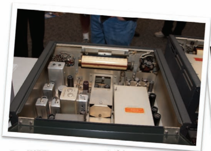
Ron K2RP presented a wonderful collection of antique radios.