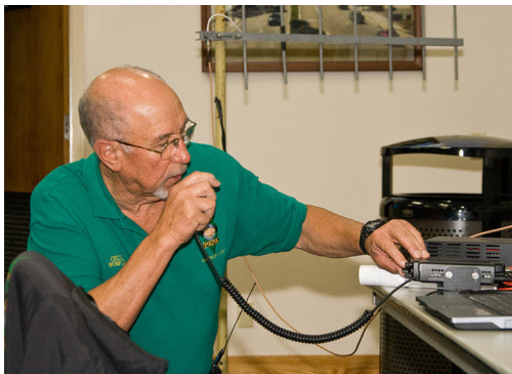
D-STAR demonstration after the presentation.